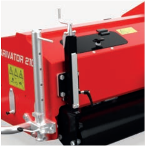
Infinitely adjustable working depth

The tines are adjustable in angle and depth up to 35 mm (1.38") to allow for varying levels of aggressiveness, and to ensure the correct working depths are achieved while protecting hybrid fields from being worked too aggressively. This precision is crucial in hybrid carpet systems where rotating blades can lift the backing from the hybrid sports field.